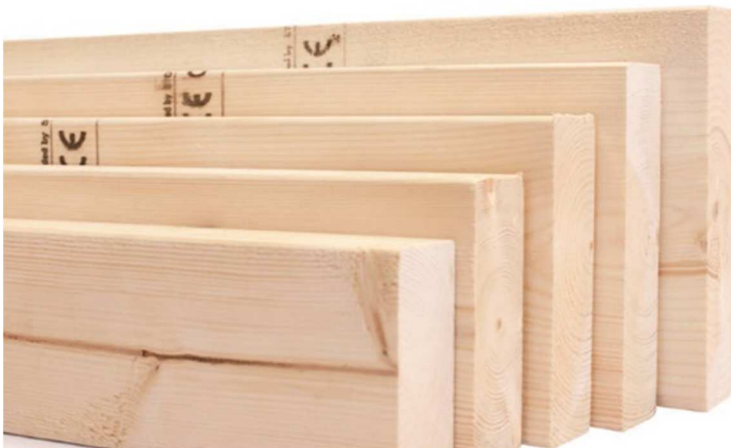
Strength graded timber