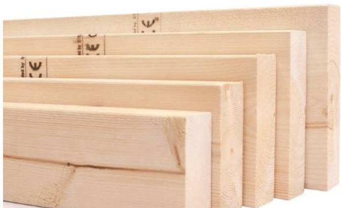
Strength graded timber, spruce