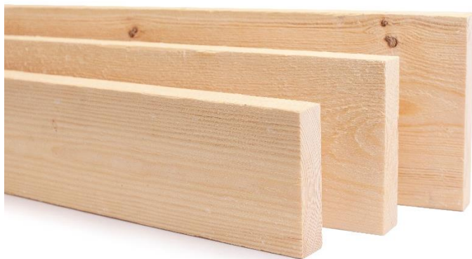
Sawn timber, pine

This declaration covers Stora Enso sawn timber products. Classic sawn of standard grades and dimensions for different joinery purposes. Classic sawn is used for construction, packaging and joinery, such as window and door manufacturing and interior products. Strength graded timber meets the quality for load-bearing structures in construction. Construction timber products are designed for a wide variety of applications in modern timber construction.